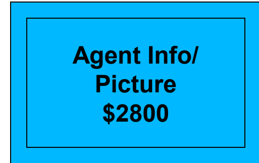
10 seconds - Quad Pod